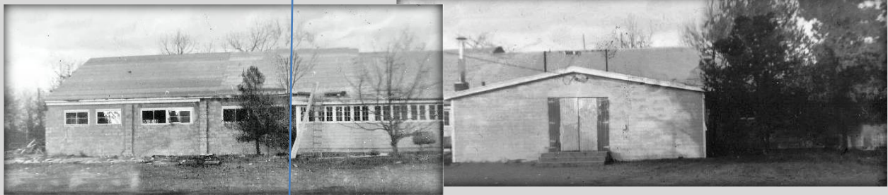
Rivervu addition 1957.