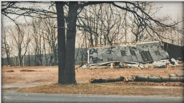
Rivervu Roller Rink demolition; 1996.