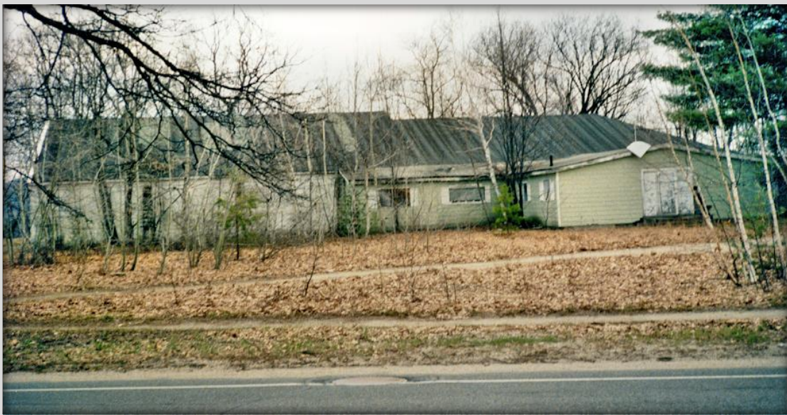
Rivervu building from Millers Falls Road. White door (right) is main entrance. c1990s